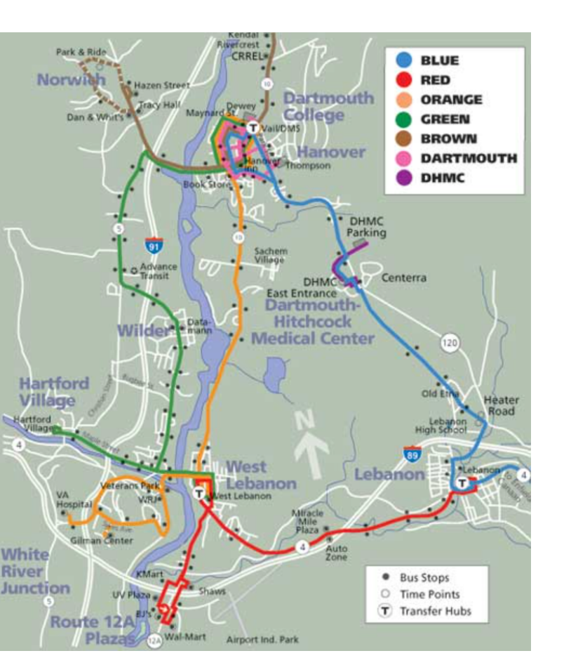
Advance Transit Map